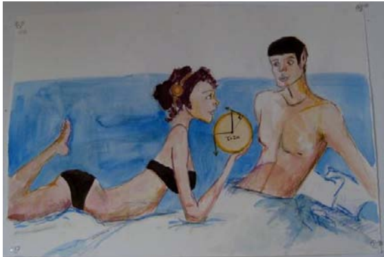
[Untitled, watercolor on paper, 22"x15"]