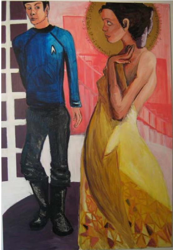
[Encounter, final version, acrylic on wood, 3.5'x5']