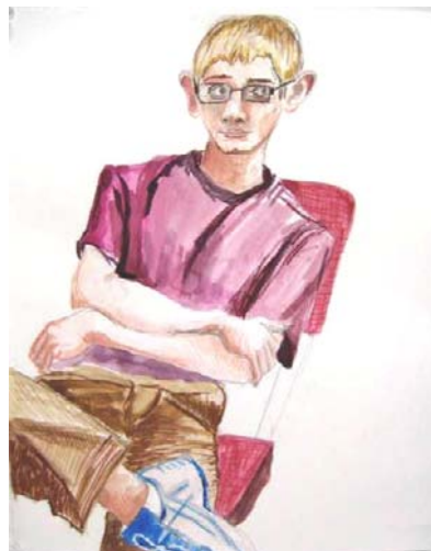
[ Dietrich , watercolor on paper, 11x14 inches]