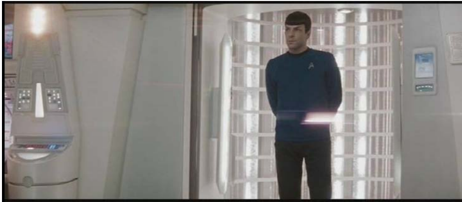
My own Screen capture from 2009 Film Star Trek directed by J.J. Abrams