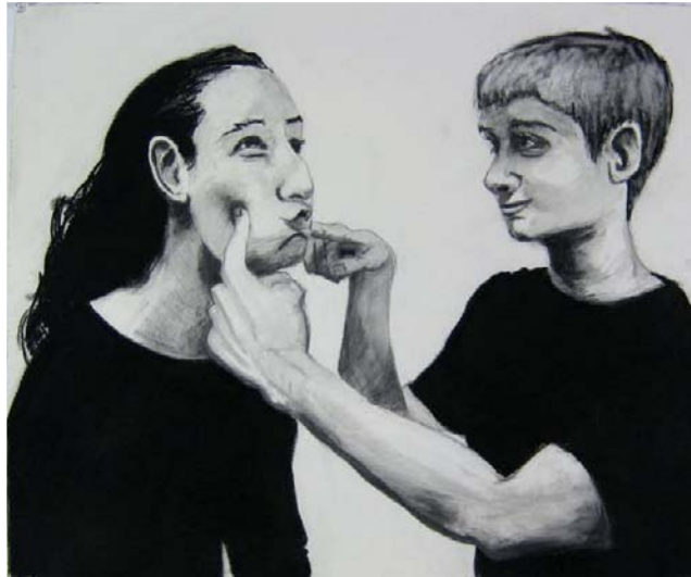
[ PV=NkT , A Relation of Pressure and Volume 3 , Charcoal on Paper, 25x21 inches]

As I write this section, and prepare this book, I am still in progress of making artwork. These most recent pieces are meant to pursue simplicity through realistic rendering and black and white media. The simple actions and narrative associated with those actions are meant to represent simple physical concepts.