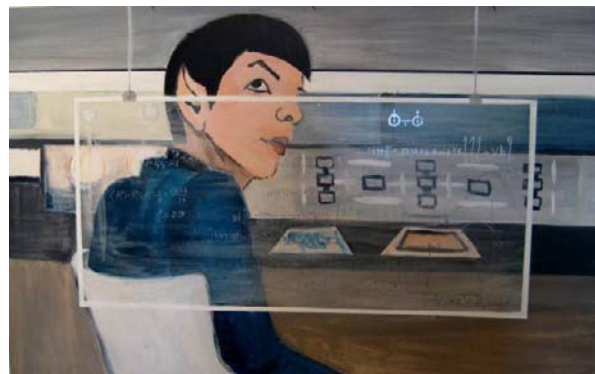
[Mr. Spock, acrylic on masonite, 4'x2']