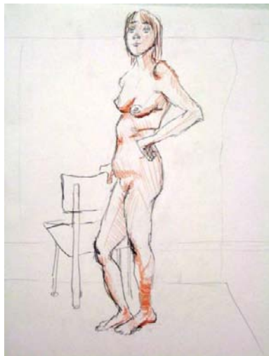
[ Liza , graphite and colored pencil on paper, 11x14inches]