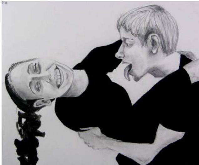
[Curl Theorem (The surface integral of the curl of a vector field is equal to the closed line integral of the vector field) 4 , graphite and Charcoal on Paper, 25x21 inches]