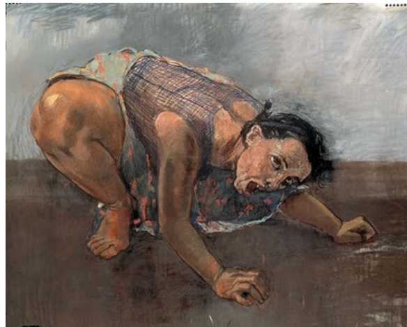
Rego, Dog Woman , 1994. ARTstor, Accessed November 26, 2010.