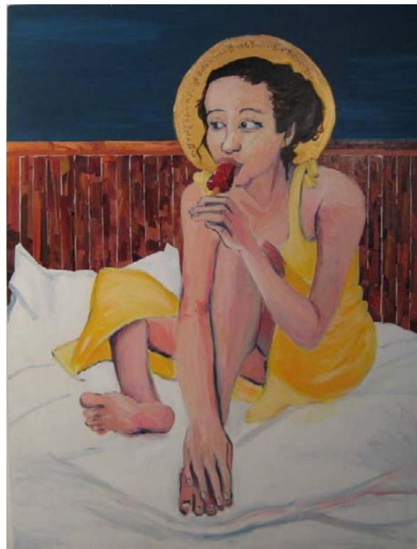
[Our Lady of Physics with a Popsicle, acrylic and paper collage on wood, 3.5'x4']