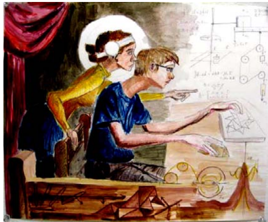
[ Exploration , unfinished version, watercolor on paper, 18x20 inches]

In physics and mathematics there are multiple ways to describe existence in space. Coordinate Systems are used as descriptions of space in order to provide consistent reference points. The most typical is the classic Cartesian coordinate system, described by the rectilinear relation of length, width and height. But this system is not always the most efficient at solving particular problems, and other systems have developed as alternates. At this point in the semester, I decided that I needed to change my own art making 'system' in order to better achieve my goals. I tried to come up with new solutions to my problems by changing my characters' identities and putting them in new spaces. As always, feedback from professors and peers also continues to influence the direction of my work.